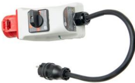
16 A – WAADAPAT16CPR