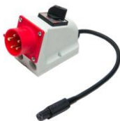
16 A – WAADAPAT16PRIEC