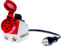
16 A – WAADAPAT16PR