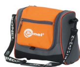
Carrying case WAFUTM6