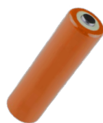
2x LR03 AAA 1,5 V battery