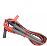
Test leads set for CMM (CAT IV, S) WAPRZCMM1