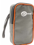
S1 carrying case WAFUTS1