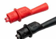
Crocodile clip mini, 1 kV 10 A (set)