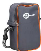
M13 carrying case