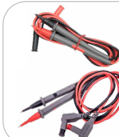
Set of test leads