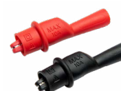
Crocodile clip mini, 1 kV 10 A (set)