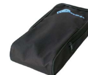
M3 carrying case