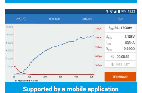
For the most harsh operating conditions