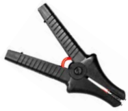
black "crocodile" clip 11 kV 32 A WAKROBL32K09