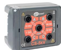
CS-5kV calibration box WAADACS5KV