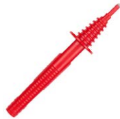
test probe with banana socket; 5 kV; red WASONREOGB2