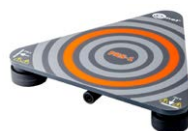
PRS-1 resistance test probe WASONPRS1GB