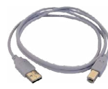
USB cable WAPRZUSB