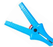
blue "crocodile" clip 11 kV 32 A WAKROBU32K09