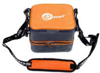
M-8 carrying case WAFUTM8