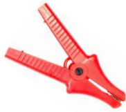
red "crocodile" clip 11 kV 32 A WAKRORE32K09