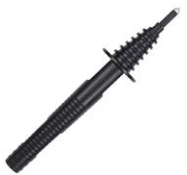
test probe with banana socket; 5 kV; black WASONBLOGB2