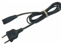
230 V power cord (IEC C7 plug) WAPRZLAD230