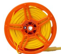
Test lead 50 m for earth resistance measurements (on a reel, banana plugs) yellow