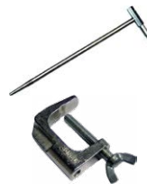
4x earth contact test probe (30 cm)