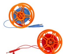
Test lead 25 m for earth resistance measurements (on a reel, banana plugs) blue / red