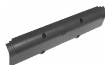
NiMH battery 4.8 V 3.2 Ah