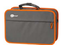
L-2 carrying case