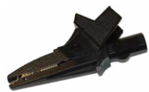
Crocodile clip 1 kV 20 A black