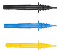
Pin probe 1 kV (banana socket) black / blue / yellow