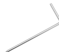
2 x earth contact test probe (rod), 25 cm