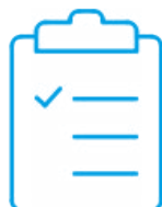
Calibration certificate issued by an accredited laboratory