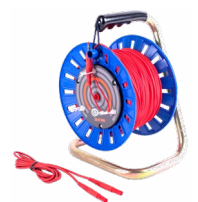
Test lead on a reel red 75 m / 100 m / 200 m

WAPRZ075REBBSZ WAPRZ100REBBSZ WAPRZ200REBBSZ