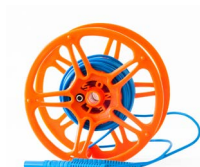
Test lead 15 m, for MRU (banana plugs, on a reel), blue