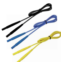
Test lead 1.2 m (banana plugs) black / blue / yellow