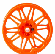
Test wire reel