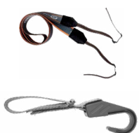
M1 hanging straps