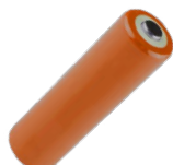
4 x alkaline battery 1.5 V AA, LR6