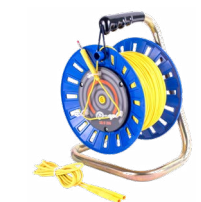
Test lead on a reel yellow 75 m / 100 m / 200 m

WAPRZ075BUBBSZ WAPRZ100BUBBSZ WAPRZ200BUBBSZ