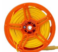
Test lead 50 m for MRU (banana plugs, on a reel), yellow