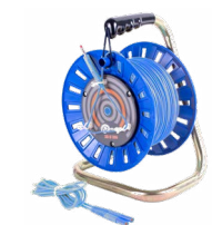
Test lead on a reel blue 75 m / 100 m / 200 m

WAPRZ075REBBSZ WAPRZ100REBBSZ WAPRZ200REBBSZ