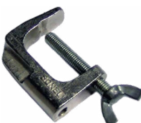
Cramp with banana socket

WAPRZ075YEBBSZ WAPRZ100YEBBSZ WAPRZ200YEBBSZ