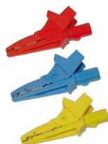
Crocodile clip 1 kV 20 A red / blue / yellow