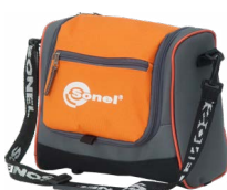
M6 carrying case