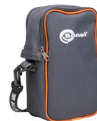
M13 carrying case