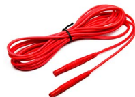
Test lead 5 / 10 / 20 m red 1 kV (banana plugs)