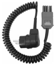
WS-05 adapter with UNI-SCHUKO angular plug