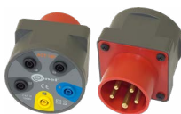
Three-phase socket adapter 16A / 32A