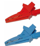
Crocodile clip 1 kV 20 A red / blue