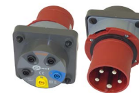
Three-phase socket adapter 63 A