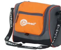
M6 carrying case