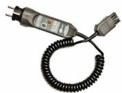
WS-01 adapter with START button with UNI-Schuko plug