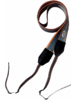
M1 hanging straps