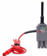
WS-07 adapter for measuring Z(L-N) loop